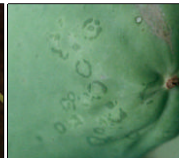
Figure 3. Close up of PRV-infected papaya fruit showing ring spots.

Damage. Since the leaf canopy of an infected tree declines as the disease progresses, fruit yield, size and quality are reduced.