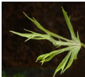
Figure 2. PRV-infected papaya leaf exhibiting shoe-stringing.

Description. Papaya ringspot is a destructive disease characterized by a yellowing and stunting of the crown of papaya trees, a mottling of the foliage (Figure 1), shoe-stringing of younger leaves (Figure 2), water-soaked streaking of the petioles (stalks), and small darkened rings on the surface of fruit (Figure 3). Other pest organisms, such as various species of mites and powdery mildew, may cause symptoms similar to PRV. Herbicides drifting onto developing papaya trees may also cause symptoms such as shoe-stringing. In severe cases, fruits may become distorted.