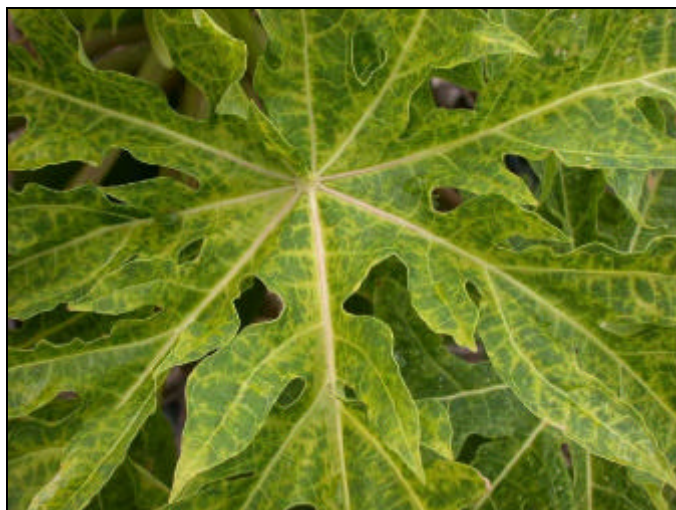
Figure 1. Papaya leaf infected with Papaya ringspot virus.