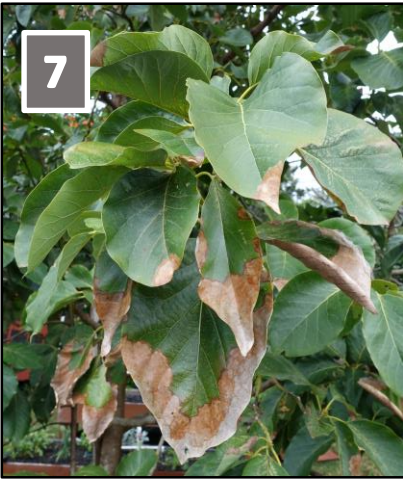
Fig. 7. NOT avocado lace bug feeding damage. Marginal leaf scorching mostly on older leaves.