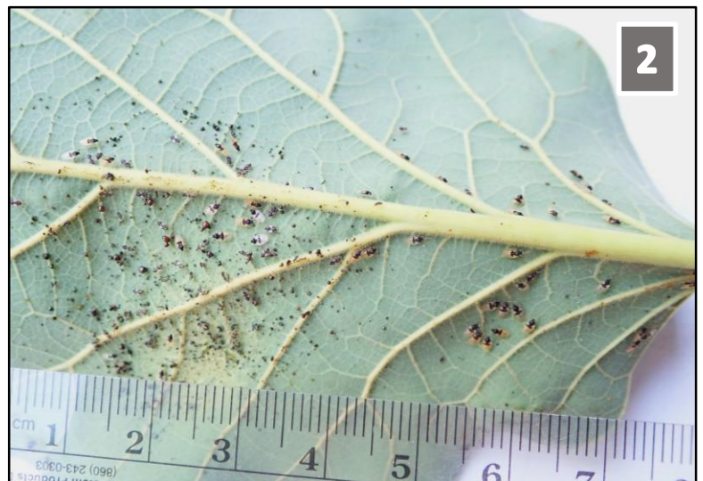
Fig. 2. Underside of avocado leaf showing colony of feeding adult and immature lace bugs alongside excrement, eggs, and nymphal cast skins.

Colonies can be found alongside excrement, eggs, and nymphal cast skins. Adults (Figs. 1, 2) are about 2 mm ( \sim 1/16 inch) in length, oval shaped, have mostly black bodies with a thick black horizontal stripe across their wings, and have yellow legs and yellow antennae with black tips. Immature lace bugs are smaller in size and range in color from dark red to black. Eggs are covered with black excrement and blend with black fecal specks (Fig. 3).