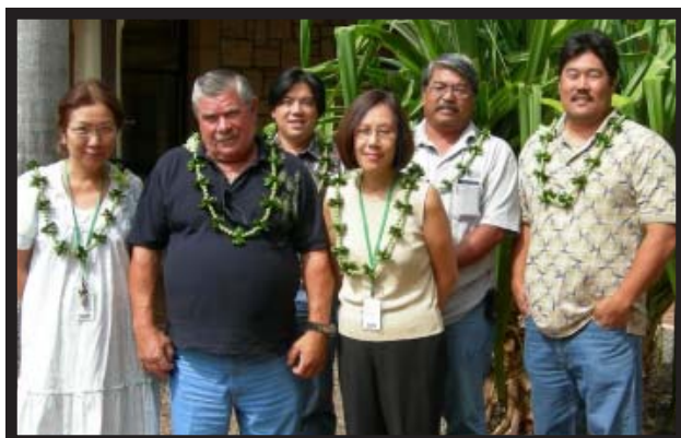
TEAM OF THE YEAR Earthquake Response Team