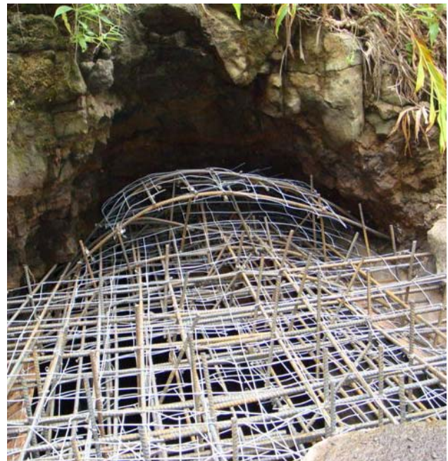
Structural work in progress at the Waimea Tunnel Stream Crossing, Waipio Valley, Island of Hawaii

Unfortunately, although the emergency work effort on the LHD system was no less extensive, the damage was significantly greater and in more remote areas. The department continues to work under a Governor's emergency declaration to restore full flow to the LHD as soon as possible.