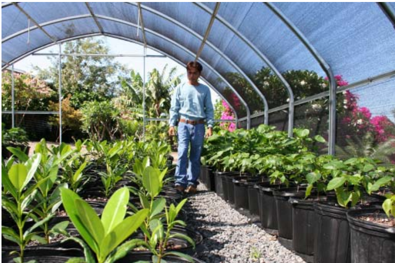
Nursery Solutions, Inc. in the Keahole Ag Park on the Big Island specializes in Native Hawaiian plants.