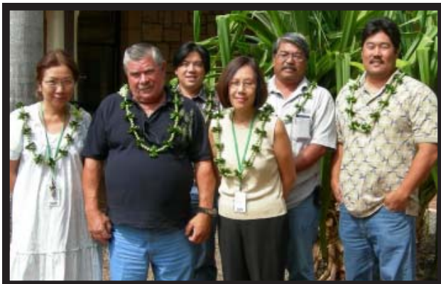
TEAM OF THE YEAR Earthquake Response Team