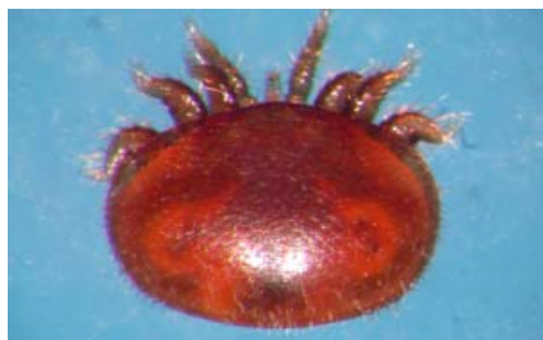
Above: A female varroa mite. The mite has only been detected on Oahu, but HDOA staff continue to conduct surveys statewide to detect the possible movement of the mite as soon as possible.