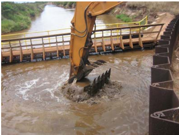
Removal of silt at Kawaele Pump Station wet well.