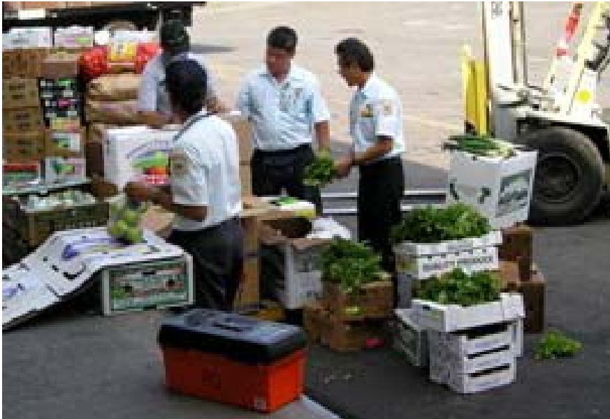
Plant Quarantine inspectors conducting increased inspections during a risk assessment at Keahole Airport in Kona.

Risk assessments provide important data on incoming pests so inspectors can determine the types of cargo and pathways that are high risks for hitchhiking invasive pests.