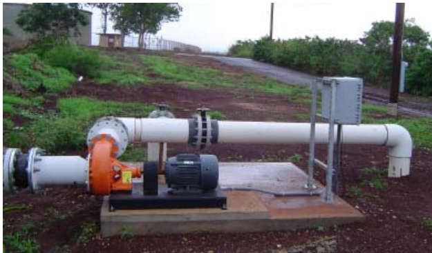
Newly installed pump-back station at Reservoir 225 in the Waiahole Irrigation System.

diversified agriculture activities, demand for irrigation water had remained strong throughout the year.