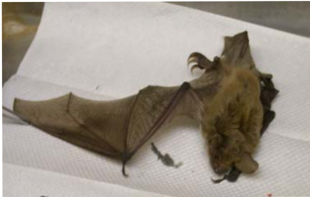
Mexican fishing bat recovered from Aloha Tower building, Honolulu, Oahu.