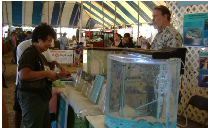
Each year, ADP's aquaculture display attracts hundreds at the Hawaii State Farm Fair.