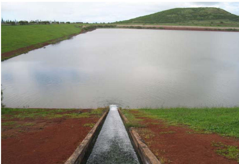
Kualapuu Reservoir, part of the Molokai Irrigation System

Nursery Solutions, Inc. is located in the Keahole Agricultural Park. A tenant since 1999, Nursery Solutions, Inc. specializes in producing native Hawaiian plants and a wide range of exotic species used in large-scale native Hawaiian reforestation, commercial forestry and