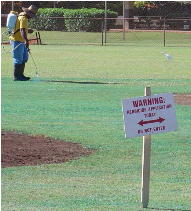
The Pesticides Branch helps to ensure that regulated pesticides are used properly, whether it be for agricultural, residential or commercial purposes.

pesticide program received an application for registering diphacinone pellets applied by aircraft. The application was for a special local need registration pursuant to Section 24(c) of the Federal Insecticide, Fungicide and Rodenticide Act. A considerable amount of data was supplied in support of this application.