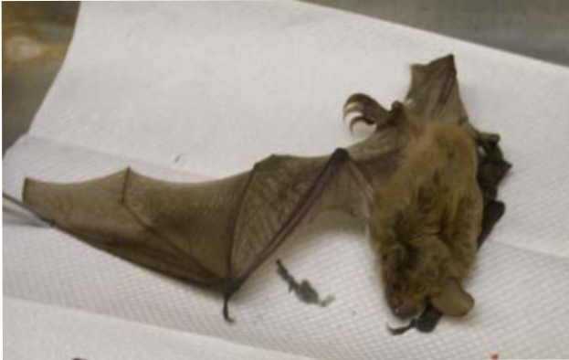
Mexican fishing bat recovered from Aloha Tower building, Honolulu, Oahu.