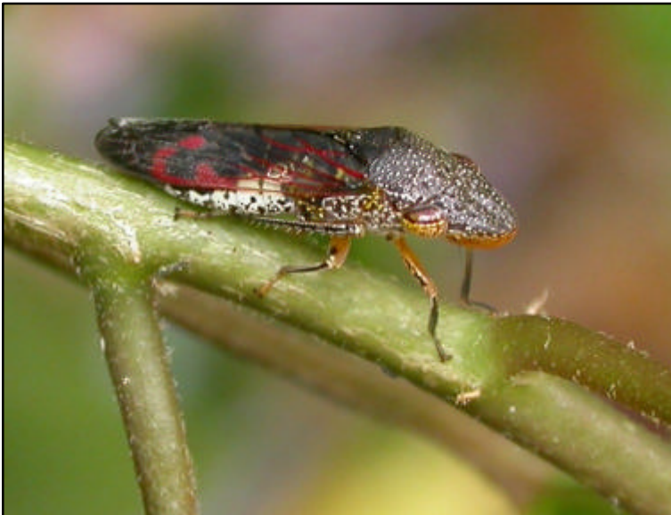
Figure 1. Glassy-winged sharpshooter adult.