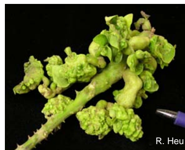
Figure 3. Erythrina petioles and leaflets exhibiting severe gall wasp damage.