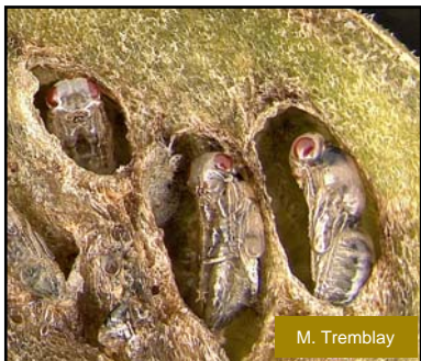
Figure 6 (above). Erythrina gall wasp pupae within a gall.