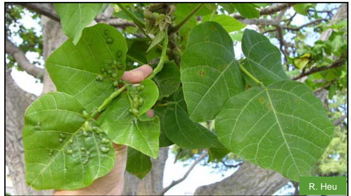
Figure 2. Erythrina variegata leaves exhibiting light gall wasp damage (left) compared with undamaged leaves (right).

Erythrina variegata , with its bright red flowers, is also known as tigers claw, Indian coral tree, and wiliwili-haole. It is a common landscape tree in Hawaii. A tall, columnar form of E. variegata , "Tropic Coral," known locally as "tall erythrina" or "tall wiliwili," is also used as a windbreak for soil and water conservation and for planting around farmsteads (Rotar et al. 1986).