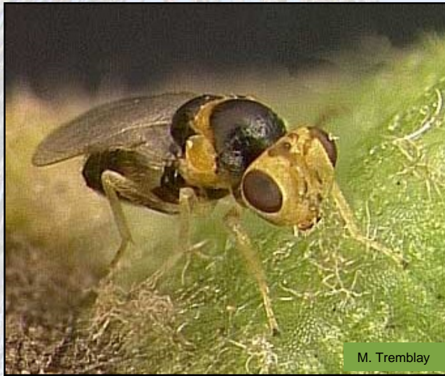
Figure 1. Enlarged photo of an adult female erythrina gall wasp. Actual length of the female is 1.5 mm. The adult male wasp, not shown, measures 1.0 mm.