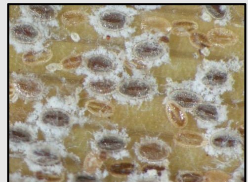
Hala scales magnified under a microscope