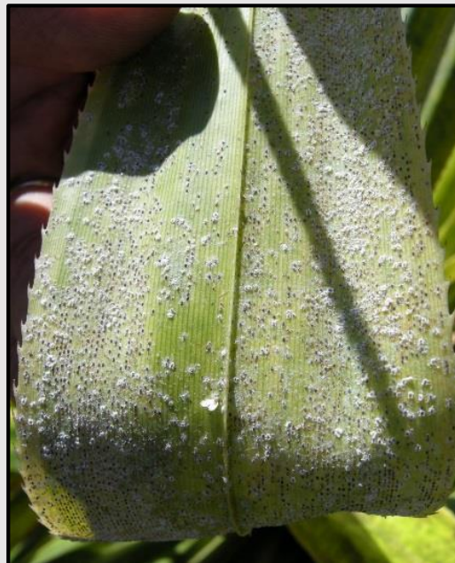
Yellowing seen on top of leaf (left) and hala scales infesting the underside of the leaves (right)

Hala is an important indigenous tree of coastal ecosystems in Hawaii and throughout the Pacific. The hala scale kills young seedlings, preventing new trees from establishing and coastal hala forests from regenerating.