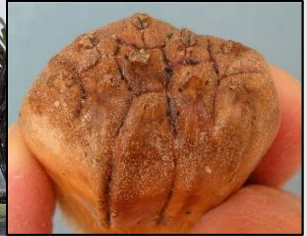
Hala scales also infest the fruit, making this another distribution pathway

The hala scale was originally discovered in Hana, Maui in 1995, and spread over the entire island within a decade. A small Oahu infestation was also detected in 2013 and HDOA is currently working to eradicate it.