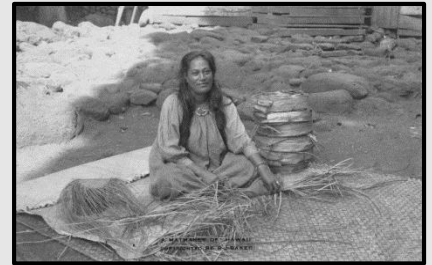
Woman weaving a lauhala mat with rolls of prepared hala leaves

The hala scale can cause leaf deformities, discoloration, stunting, twisting, yellowing, and leaf blade length can be greatly reduced, rendering them useless to weavers. It also attacks the tree's fruit, can cause entire crowns of the plant to fall off, and even premature death of the entire tree.