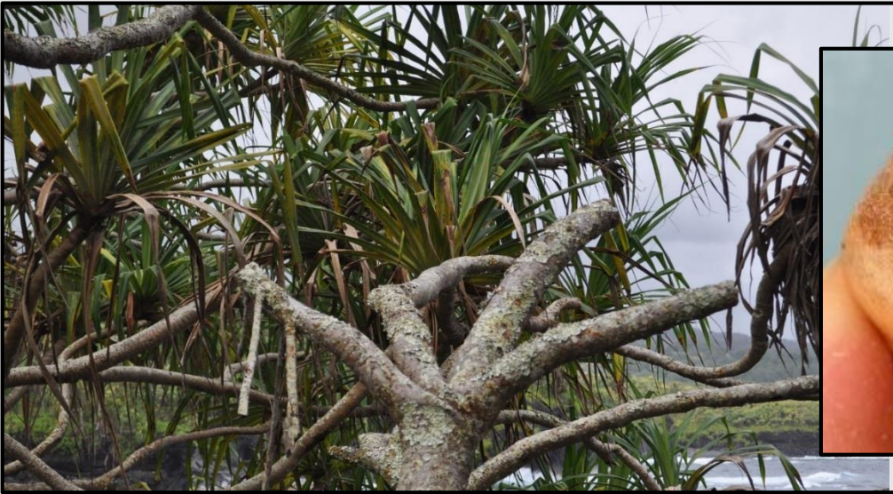
Visible dead leaves and dying crowns on an infested hala tree from the coastal hala forest of Hana, Maui