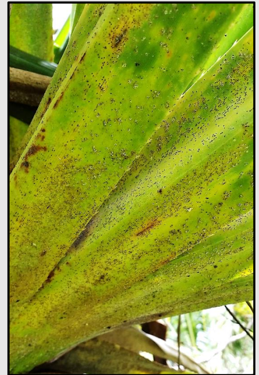
Leaf yellowing/discoloration of severely infested hala crown