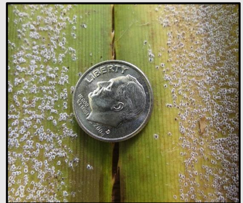
Hala scales compared in size to a dime

Hala is an important indigenous tree of coastal ecosystems in Hawaii and throughout the Pacific. The hala scale kills young seedlings, preventing new trees from establishing and coastal hala forests from regenerating.