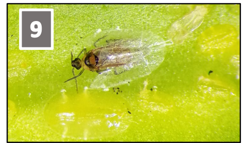
Fig. 6. Green scales can also be mistaken for the croton scale; green scales appear to have two black dots as eyes.