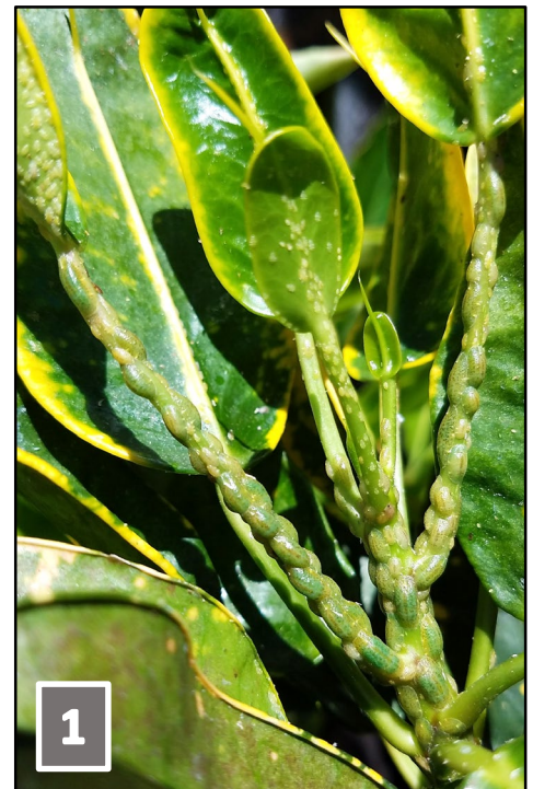
Fig. 1. Many overlapping generations of female croton scales congregate on stem and petioles of croton.

The croton scale has the potential to become problematic for residential areas, nurseries, and commercial landscapes as croton is a widespread landscaping plant. Additionally, many of the croton scale's other hosts are common throughout the State.