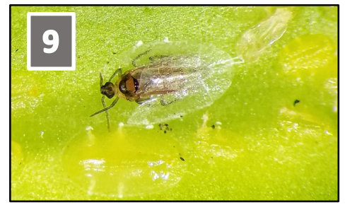
Fig. 6. Green scales can also be mistaken for the croton scale; green scales appear to have two black dots as eyes.