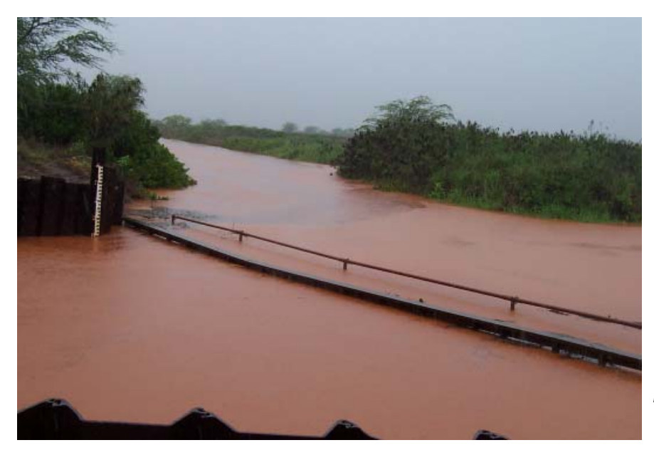
The catwalk area at the Kawaiele pump station in Kekaha was under water during the record rainfall on Kauai in March 2006.

appurtenant structure repairs and vegetation removal from dam embankments pending capital improvement project (CIP) funding approval from the legislature.