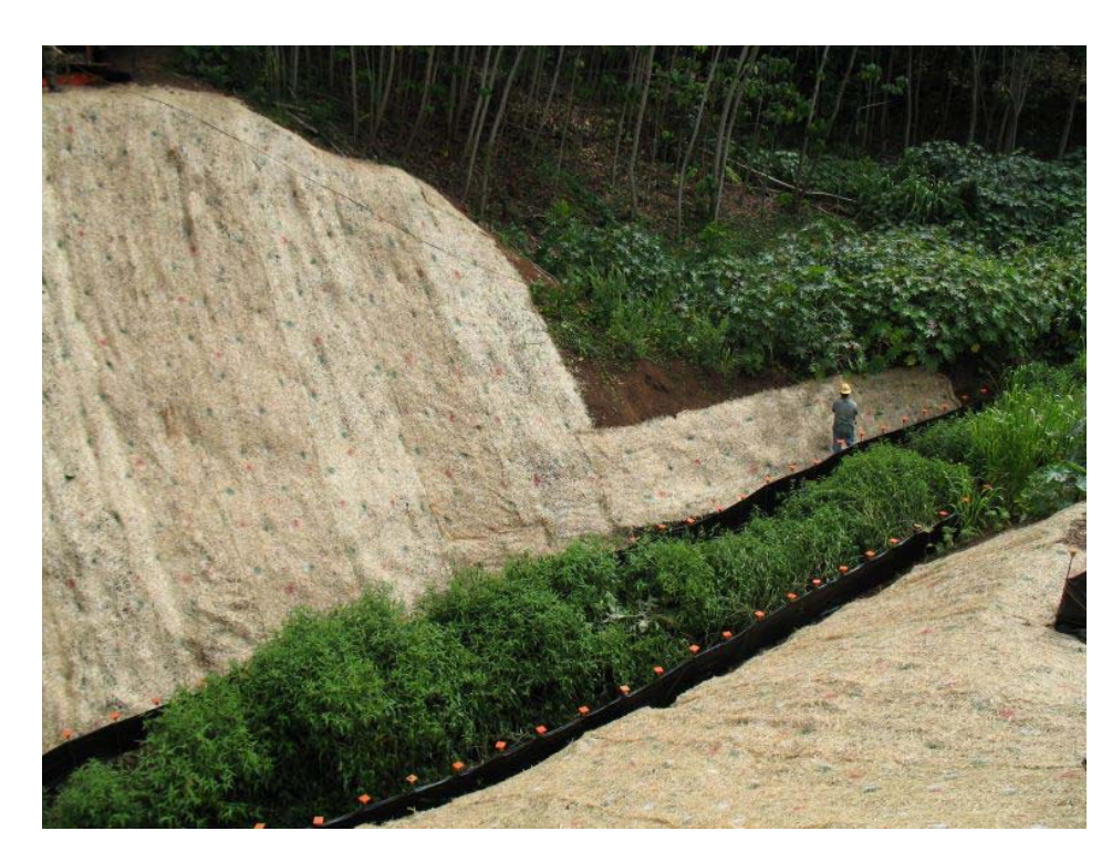
Emergency Breach of the Kailua Reservoir – Waimanalo, Oahu

Many of Hawaii's farmers experienced extremely wet conditions in the second half of the fiscal year. For nearly seven weeks between mid-February and early April 2006, much of the state had a highly unusual, extended wet period. The Waimanalo area received 150 percent of normal annual rainfall in just seven weeks. The saturated ground and continuing rainfall caused widespread flooding and crop damage throughout the farming community.