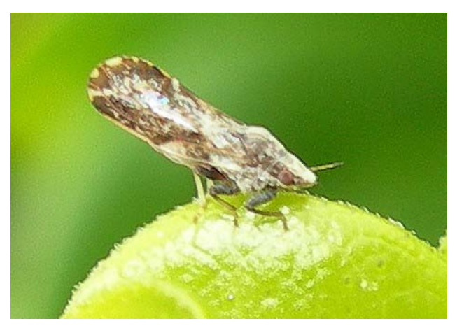
Above: Asian citrus psyllid was first identified in Hawaii in May 2006 on the east side of the Big Island.

determination. This may take quite a while because, like the EGW when it first invaded Taiwan, Singapore, Mauritius, and Reunion in 2004, these parasitic wasps will most likely be found to be unknown species so they will have to be described by specialists and given a species name. One species belongs to the family Eurytomidae and the other two to the family Eulophidae. Each parasitoid will have to undergo host specificity testing in the IQF to determine that it is suitable for release in Hawaii as a biocontrol agent to suppress EGW infestations.