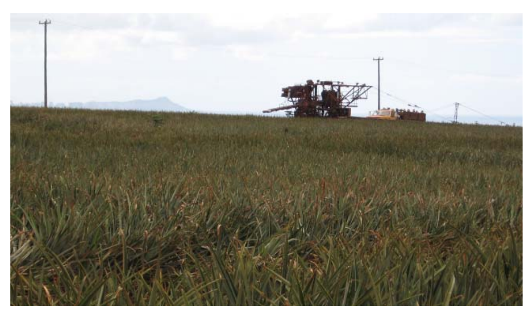
The last harvest for Del Monte pineapple in Kunia.

Transfer of the irrigation system and the approximately 7,000 acres of state-own agricultural land in the Kalepa area to ADC was temporary put on hold because of environmental concerns and a potential contested case involving water rights.