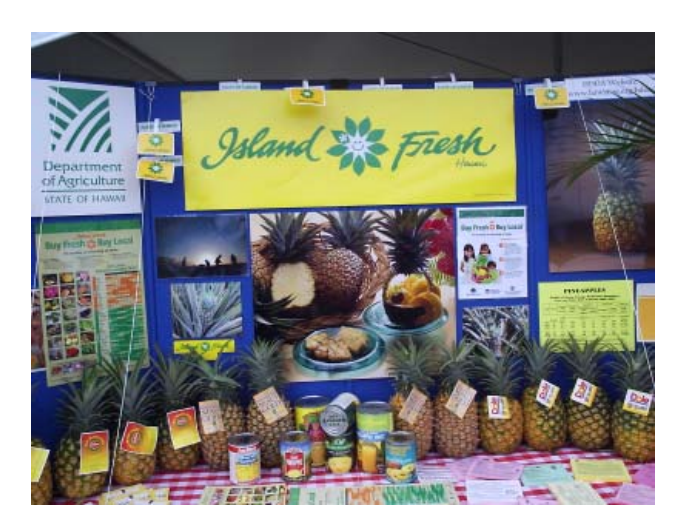
Market Development Branch display at the Wahiawa Pineapple Festival.

The introduction of new direct flights from Vancouver, British Columbia to Honolulu and Kahului has stimulated new commercial activities between the Canadian province and Hawaii. ADD/MDB in partnership with the U.S. Department of Commerce and Harmony Airways has opened new markets for Hawaii agricultural producers and entrepreneurs. Various products, including papayas, pineapples, sweet potatoes, herbs, avocados, mangoes, flowers, and fish are being exported to Vancouver at an annual value of $2.3 million. Another $1 million worth of Canadian agriculture products (flowers/plants, fish