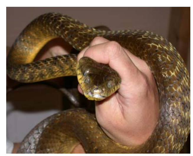
Proper handling of a brown treesnake during training session in Guam.

Species Committee (MISC) conducted a series of snake searches in the surrounding area including the deployment of traps for a three-week period; however, no snakes were captured or sighted during the response.