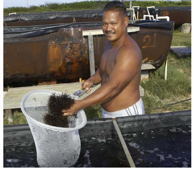
Aquaculture now supplies about 99 percent of limu ogo (seaweed) sold in Hawaii. Hawaiian Marine Enterprises in Kahuku has been supplying customers for more than 15 years.