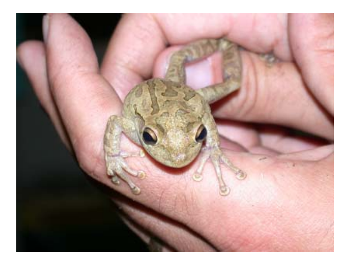
This Cuban tree frog that was intercepted by HDOA inspectors conducting inspection of plants shipped via Federal Express from Florida.