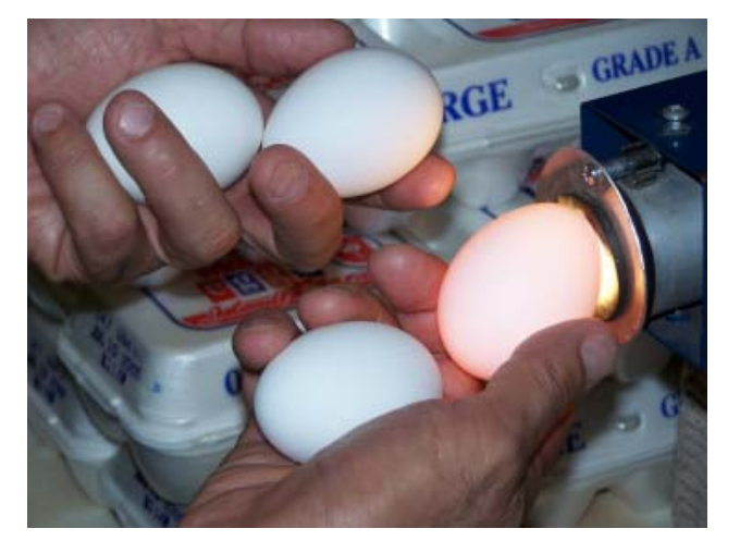
Above: Egg inspectors use a "candler" to inspect eggs for quality and grade.