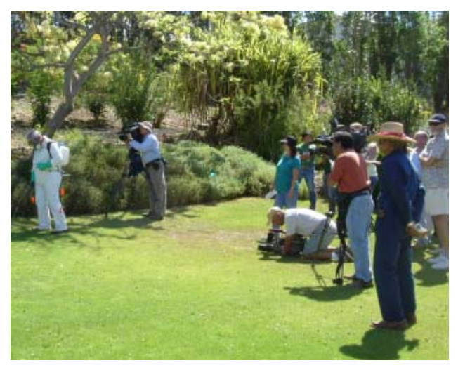
Staff from the Pesticides Branch and Plant Pest Control Branch held a workshop for the public and the media at CTAHR's Urban Garden Center demonstrating the proper use of hydrated lime for the control of coqui frogs.

The Department of Agriculture reorganized to move the Chemical Analysis Laboratory from the Quality Assurance Division to the Plant Industry Division. This move was authorized to make better use of Federal funds available to the pesticides program. The laboratory analyzes about 500 samples a year for pesticides. The laboratory is located at the Department of Health Laboratory on Waimano Home Road in Pearl City.