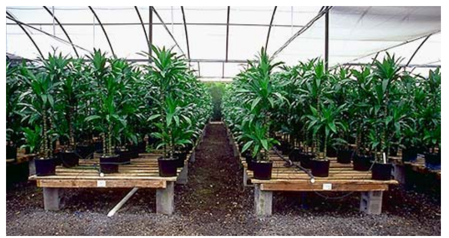
Left: Benches of nursery plants at Hawaii Foliage Exports, Inc., located in the Panaewa Agricultural Park on the Big Island.

Bottom: Prasong Hsu's chili pepper plants and pumpkin patch at the Kahuku Agricultural Park on Oahu.