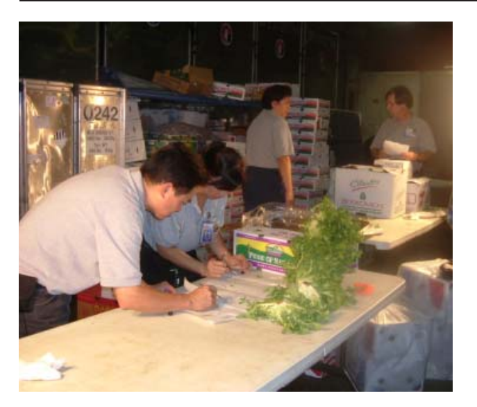
Teams of inspectors conduct the Oahu Risk Assessment that intensifies inspection over a period of time to determine high risk commodities and their routes of entry.

$1,000.00 each, and surrendered ownership to the animal enclosures. The Moiliili man is currently in federal custody and the case is pending.