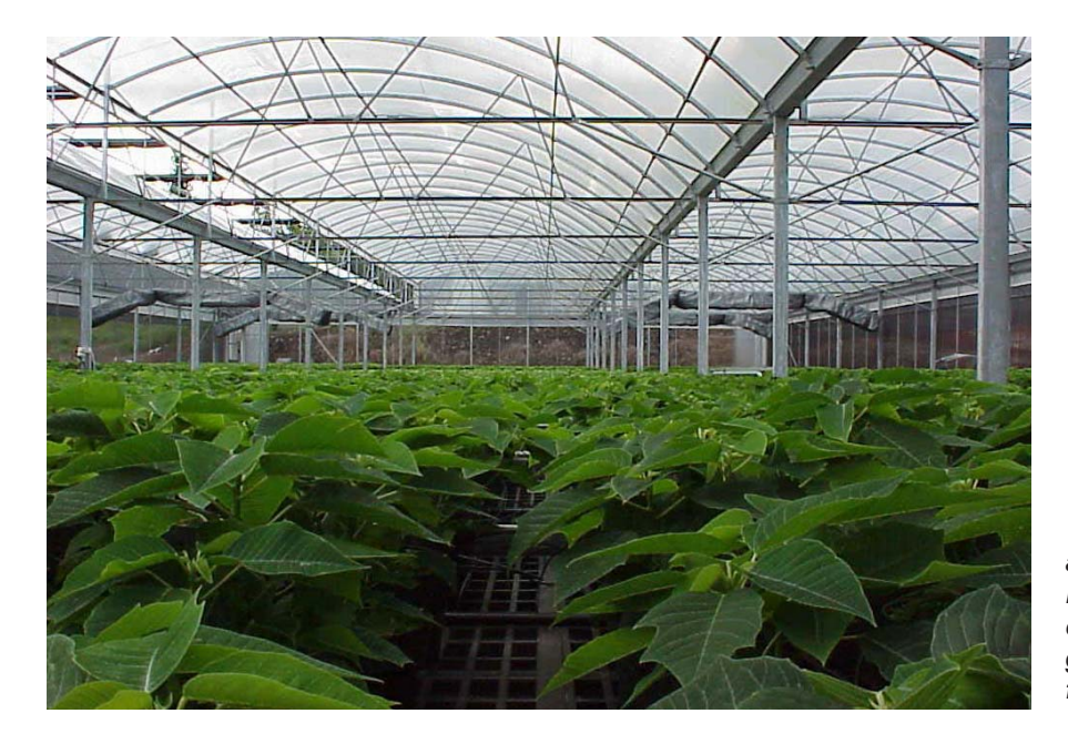
With the assistance of an agricultural loan, Neil Okimoto in Pahoa on the Big Island constructed a 16,000 square-foot greenhouse to grow poinsettias for the Christmas season.

Agriculture no longer encompasses only growing crops but also includes agro-tourism and value-added products. As the agricultural and aquacultural industries evolve, the division must constantly adapt to the new markets, technologies and needs of the farm community. The division remains supportive of agriculture and aquaculture and will continue to serve as a resource and safety net to these industries. The division will continue its outreach to increase awareness of the program.