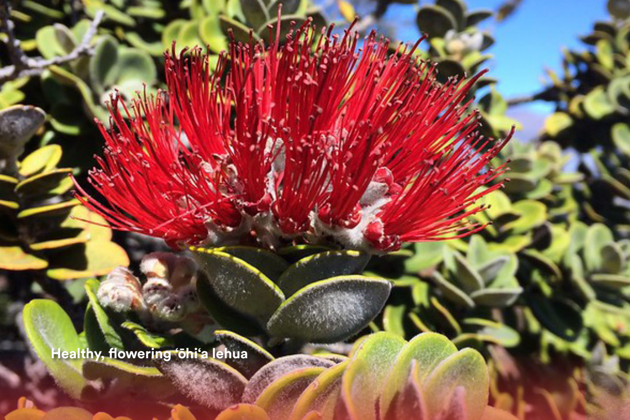
Healthy, flowering 'ōhi'a lehua