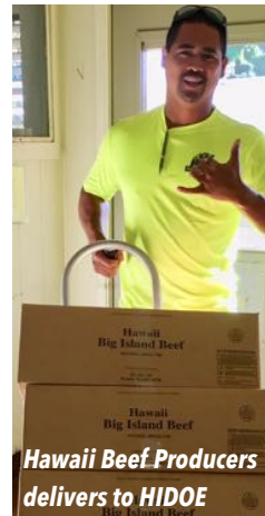
Hawaii Beef Producers delivers to HIDEO