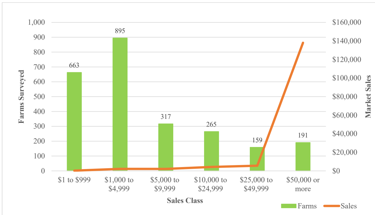
Total Food Value Sold Locally by Farms Sales Class, Hawaii 2017*

*Calculated values derived from NASS data.