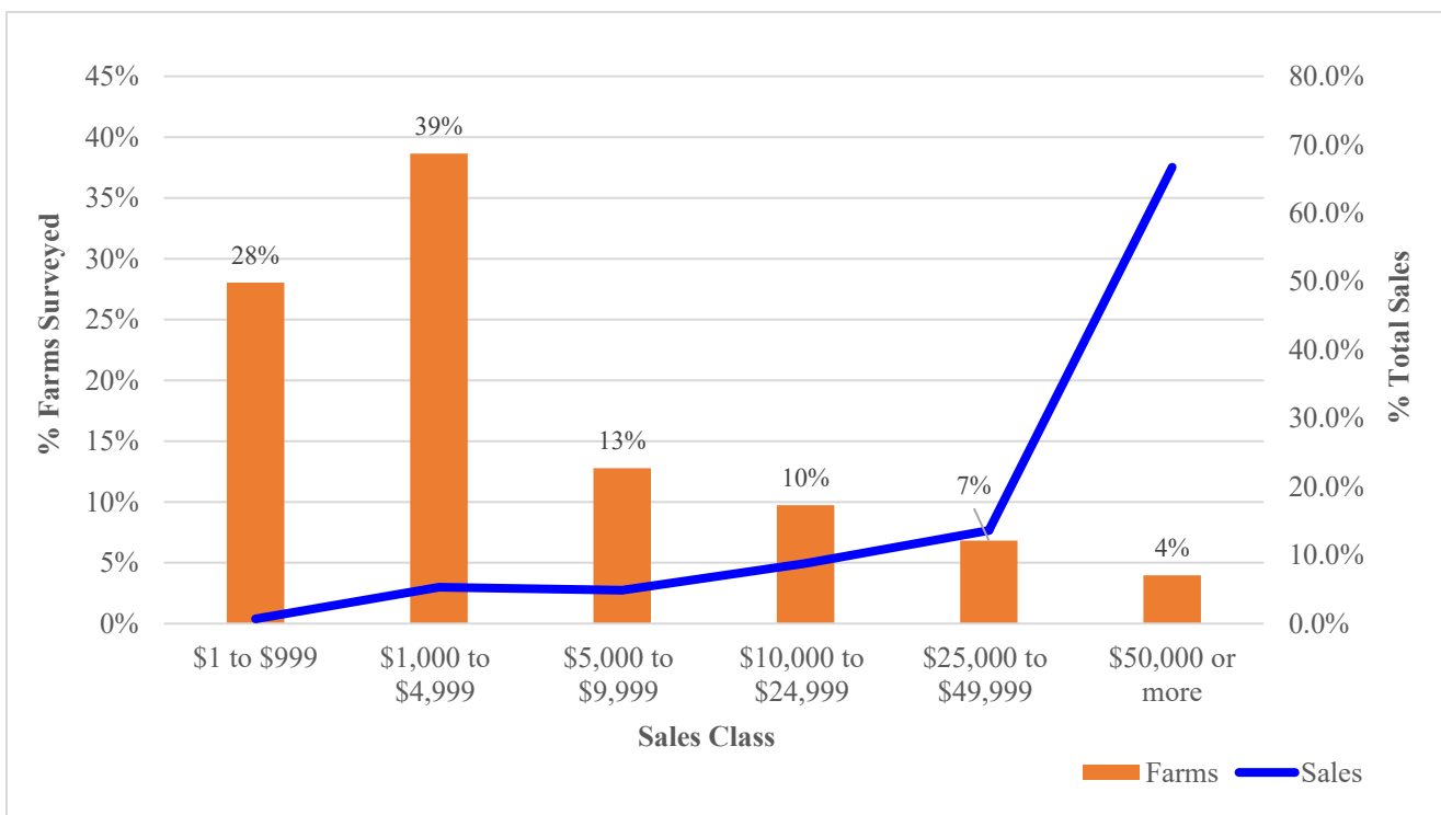
Food Sold Directly to Consumers by Farm Sales Class, Hawaii 2017*

*Calculated values derived from NASS data.